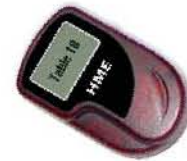
Alpha Numeric Pager