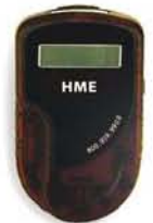
Rechargeable Numeric Pager